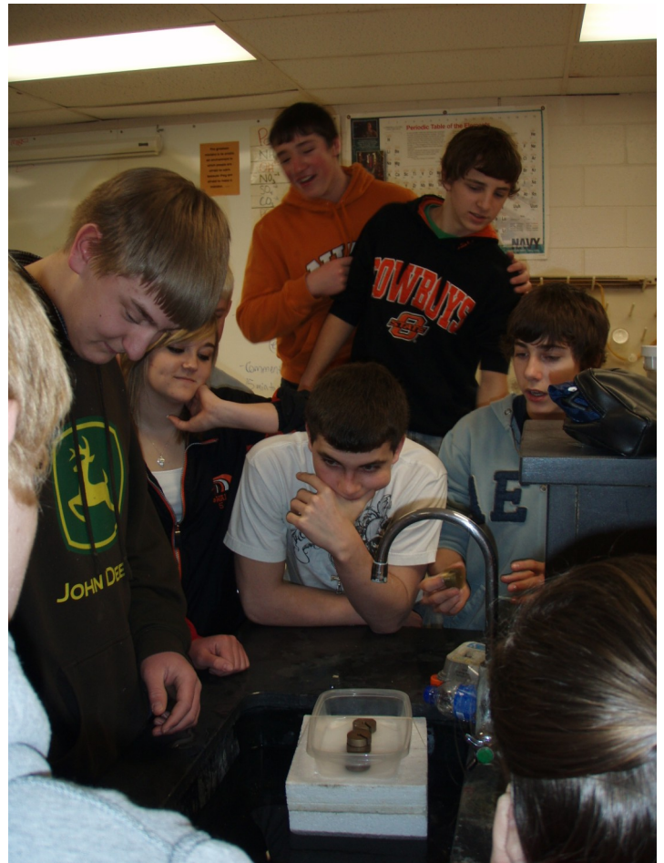
Other students look on as the boat builder adds weights during the contest.