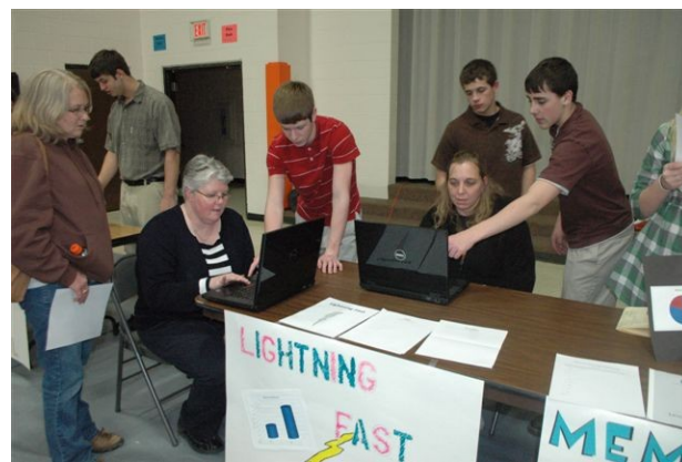
Students tested the reaction times of willing participants, and males were still found to be quicker than females.

Alone we can do so little; together we can do so much.