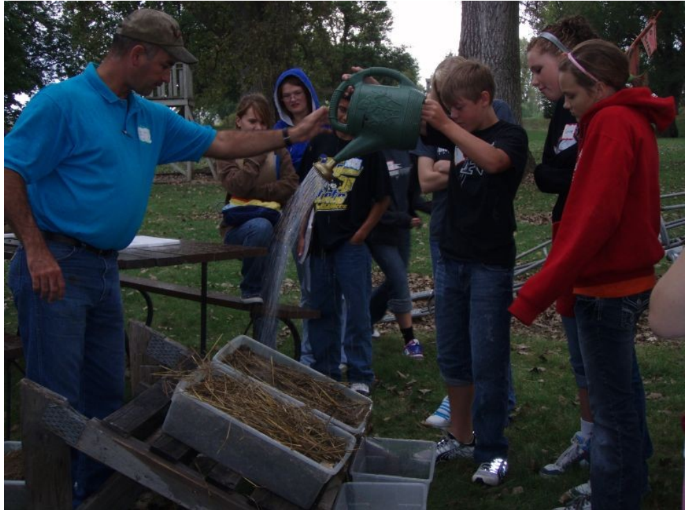
The Elgin team gets involved as "rainstorms" to show how regular till and no till soils hold up to erosion.