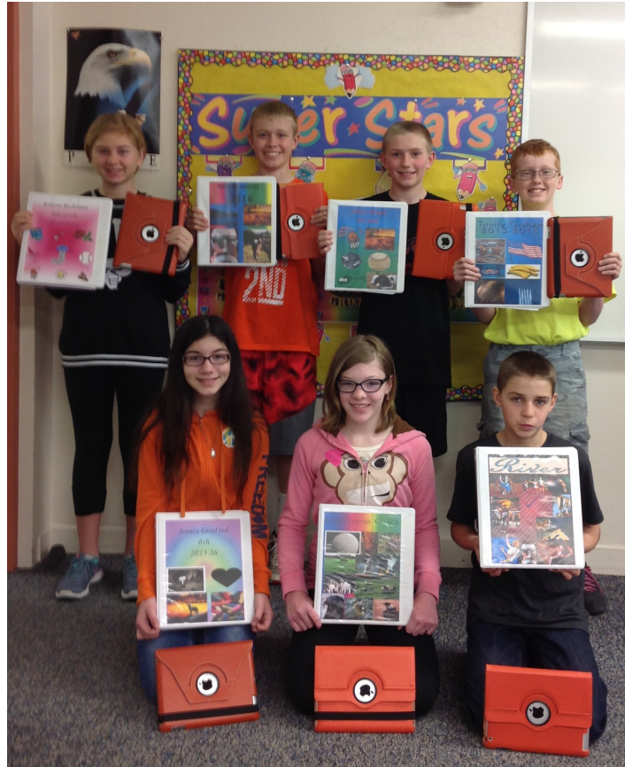
6th Graders utilized their iPads and portfolios to showcase their year for their parents. Students: job well done. Parents: thank you so much for coming.

The fourth graders are publishing their own book after all the writing they've done this year. They decided to write about what they've learned this year, what their classes were like, and some of their favorite memories. Both illustrations and digital pictures are in the book. They are learning a lot in the process and will have a cool keepsake for years to come.