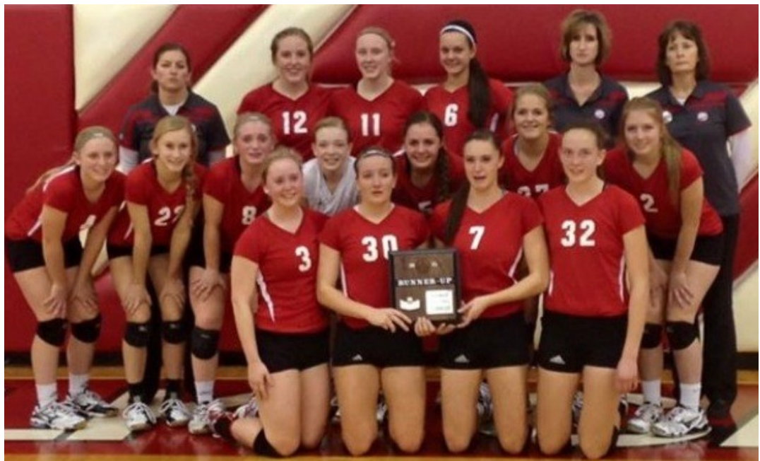
The 2015 Lady Wolfpack Volleyball Team was District Runner Up as the season ended with a 5 set loss to Crofton. The team ended with a 25-7 record.