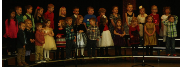
Preschoolers entertaining all during their Christmas Concert.