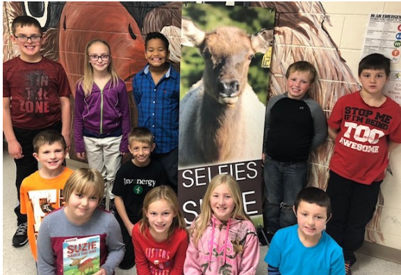
Selfie with Suzie!