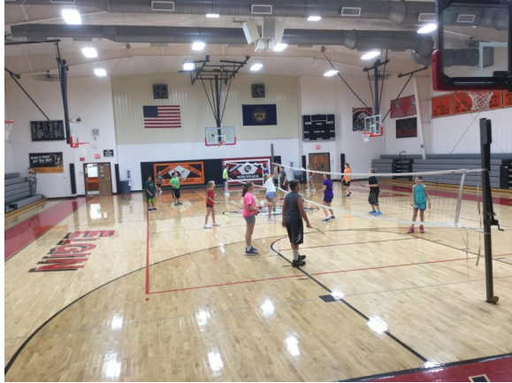
PE students have been working on their badminton skills.