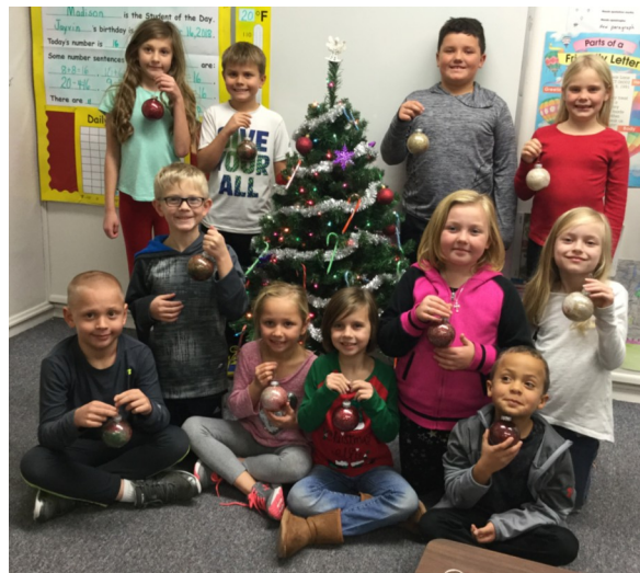
The second graders had fun making an ornament for our tree and were excited to take them home for a Christmas present for their parents or grandparents.

For the most current news and calendar, go to www.elgineagles.org .