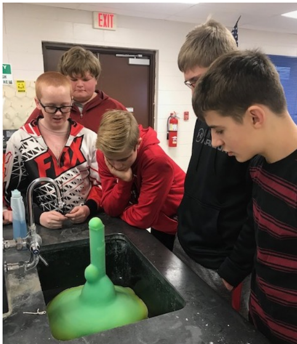
The physical science class made "elephant toothpaste" to demonstrate how an exothermic reaction happens.