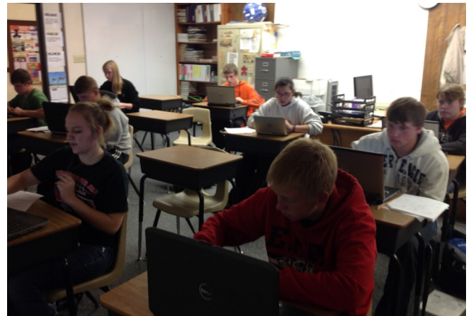
This years' Algebra I class are studying electronically for their test! Good Luck!!

Residents of District 18, Elgin, are notified that School District 18, Elgin, NE participates in all required Special Education Services for all resident students, ages 0-21. If you know of any student not currently being serviced by an appropriate educational program or have questions concerning the Special Education Program, contact the Superintendent's office at Elgin Public School. Elgin Public School does not discriminate on the basis of race, color, national origin, sex, age, or handicap. Further, the school complies with all Title IX and Equal Employment Opportunity guidelines as determined by Federal directives.