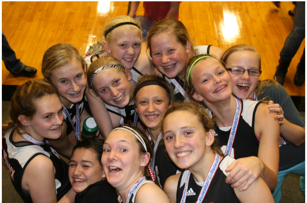
Junior High Volleyball players complete their volleyball season!

"Everyone on the team contributed to the win. The girls certainly earned their medals today. "The coaches credit the girls for their work ethic and continuous improvement throughout the season. "We improved in every aspect of our game from beginning to end because these kids are competitors and they want to do well. We were blessed once again with some terrific kids this season. We had fun and we grew by leaps and bounds. You can't ask for more than that as a coach."