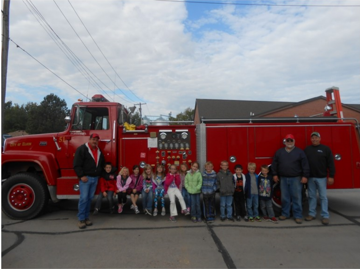
The first grade got the chance to visit the fire station and ride on the fire truck. It was a fun trip. Thank you firemen!