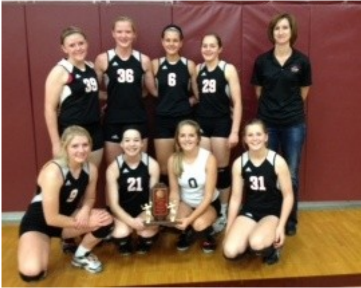
The Freshman Wolpack Volleyball team were Runner-Ups at the Neligh Freshman Tournament. They beat Neligh in the first game 25-12 25-17 and lost to Norfolk Catholic in the Championship game 22-25 19-25. It was a good experience for these girls!