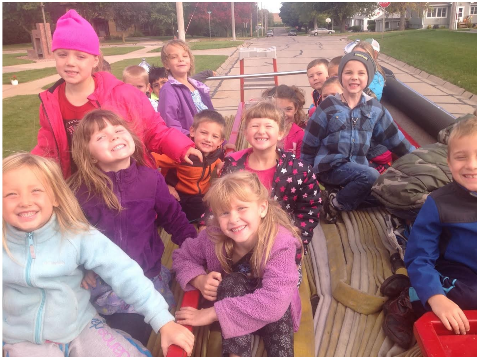
Kindergarten students visited the Fire Station on October 8. Thank you to the volunteer firemen for the talk, ride, and treats and all that you do to help keep us safe.