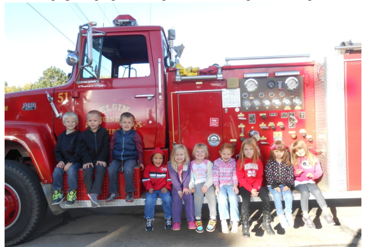
The Preschoolers toured the Fire Station during Fire Prevention Week. We also spent the week learning about fire safety.