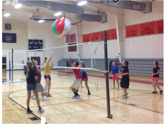
Freshmen enjoy a game of Giant Beach Ball Volleyball during P.E.