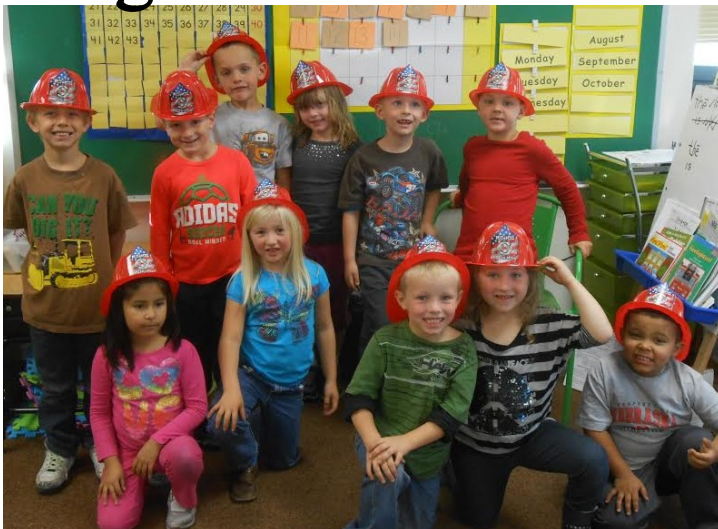
On October 14 the kindergarten class visited the Elgin Volunteer Fire Department. We enjoyed the tour and of course the fire truck ride around town. Thank you to the volunteers for everything you do for us.