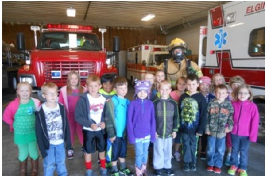
The first graders had fun touring the fire station and riding on the fire truck. Thank you for everything you do!

Elementary Christmas Concert- December 17th at 7:30 pm