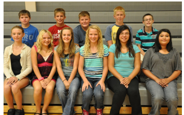
100% of last year's 6th grade class met or exceeded the standard in reading.