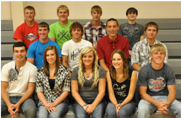
100% of last year's Junior class met or exceeded the standard in science.

To score in the 90 th percentile means the student scored as well as or better than 90% of student in their grade on that assessment. In other words these students' scores are in the top 10% of students in their grade. I would also like to commend the 6 th grade as 100% of the class met or exceeded the standard in reading. Also, the 11 th grade as 100% of the junior class met or exceeded the standard in science. We are proud of all of these students as we continue to strive for excellence in all grade levels and on all local, state, and national tests.