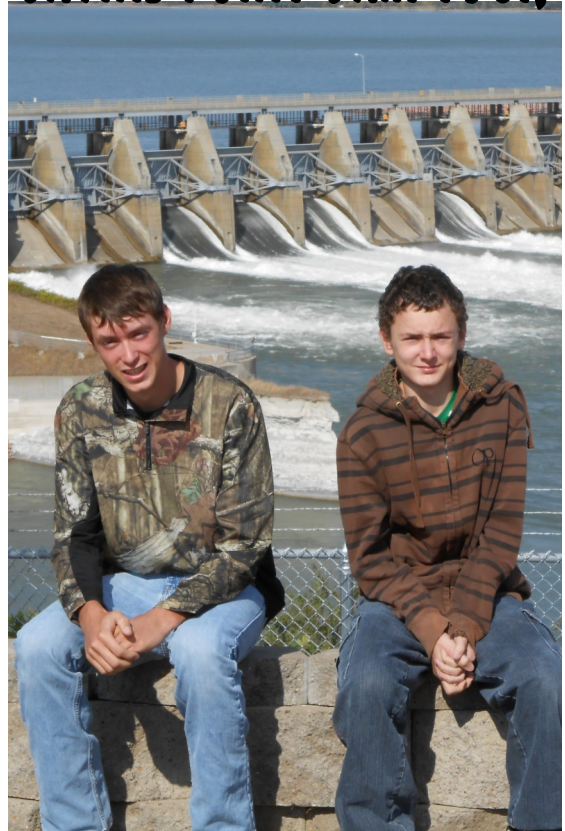
Technology students visit Gavin's Point Power Plant