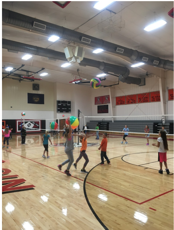
3rd and 4th graders were having fun learning about Volleyball in PE class.

Check out the class pictures for all of the grades on the webpage! Go to "Students-Group Photos" to see how great everyone looked on Picture Day.