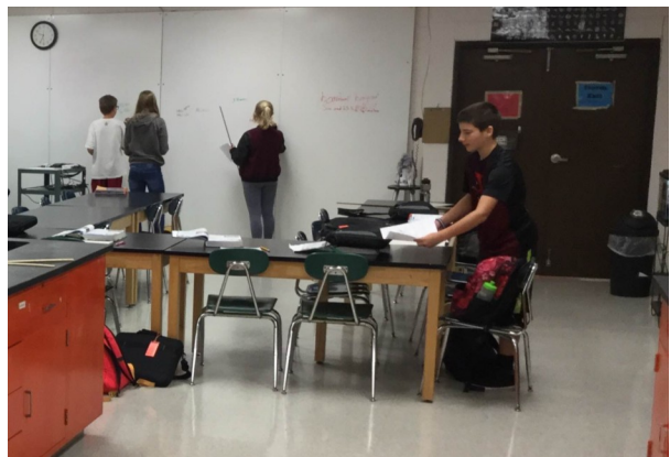
The 8th grade Earth Science class has been learning about maps for the past week. Here students are taking measurements from around the room to create a scaled down version that will fit exactly on one sheet of paper. Students had to carefully measure so that the room maintained its correct dimensions as well as convert so the map could have an accurate legend.