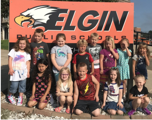
Kindergarten Class of 2031