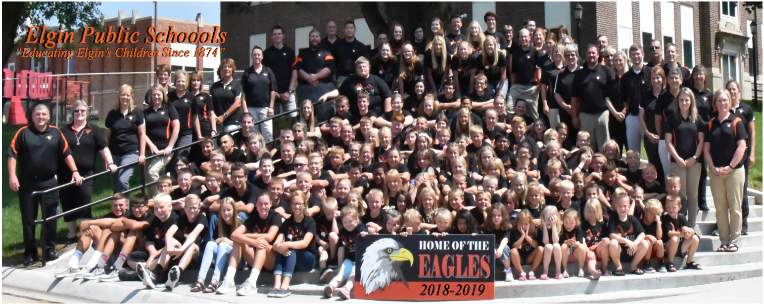
Elgin Public Schools "Educating Elgin's Children Since 1874"

Elgin Public School students and staff are off to a great start! School began on August 15 th with 166 students in grades PreK-12. All students were given an Elgin Eagle t-shirt. The shirts boast that "every eagle soars" at Elgin Public Schools.