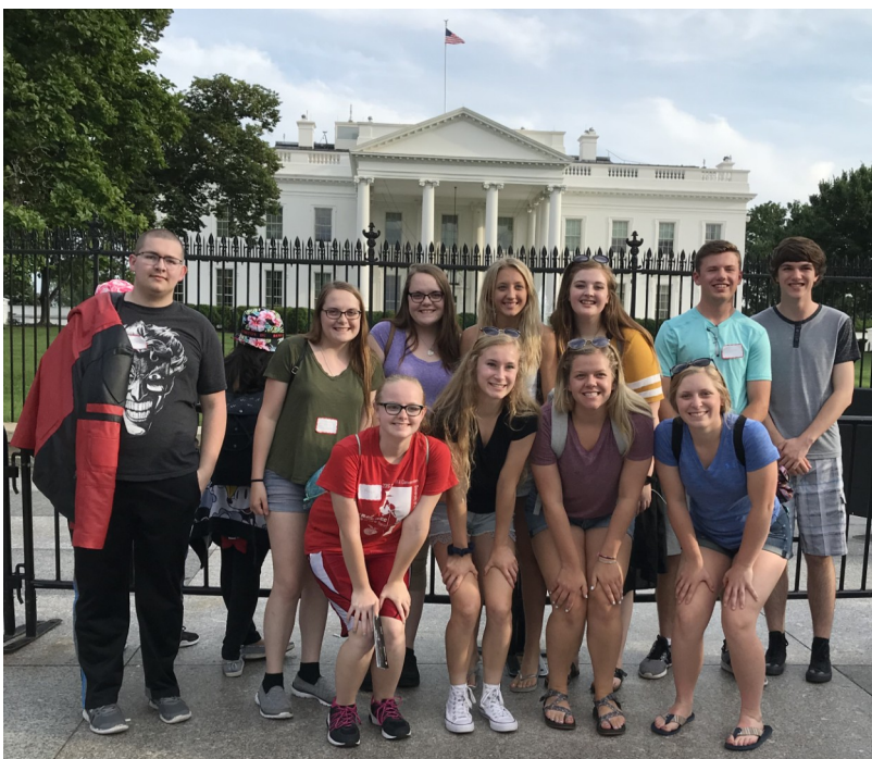
This years senior class had an amazing time on the trip to Washinton D.C. over the summer!