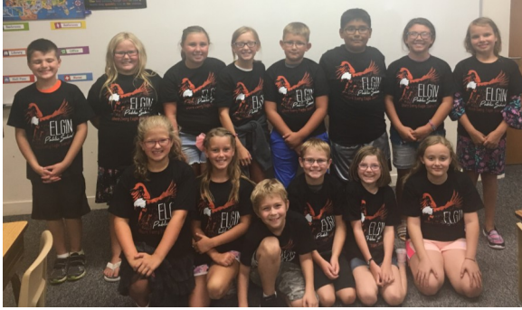
The 4th Graders are ready to have a great year!