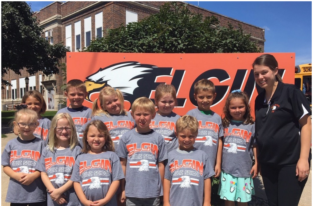
The 1st grade class is ready for an awesome year of learning!