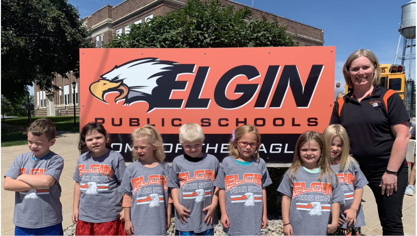
Kindergarten is ready for a new year!