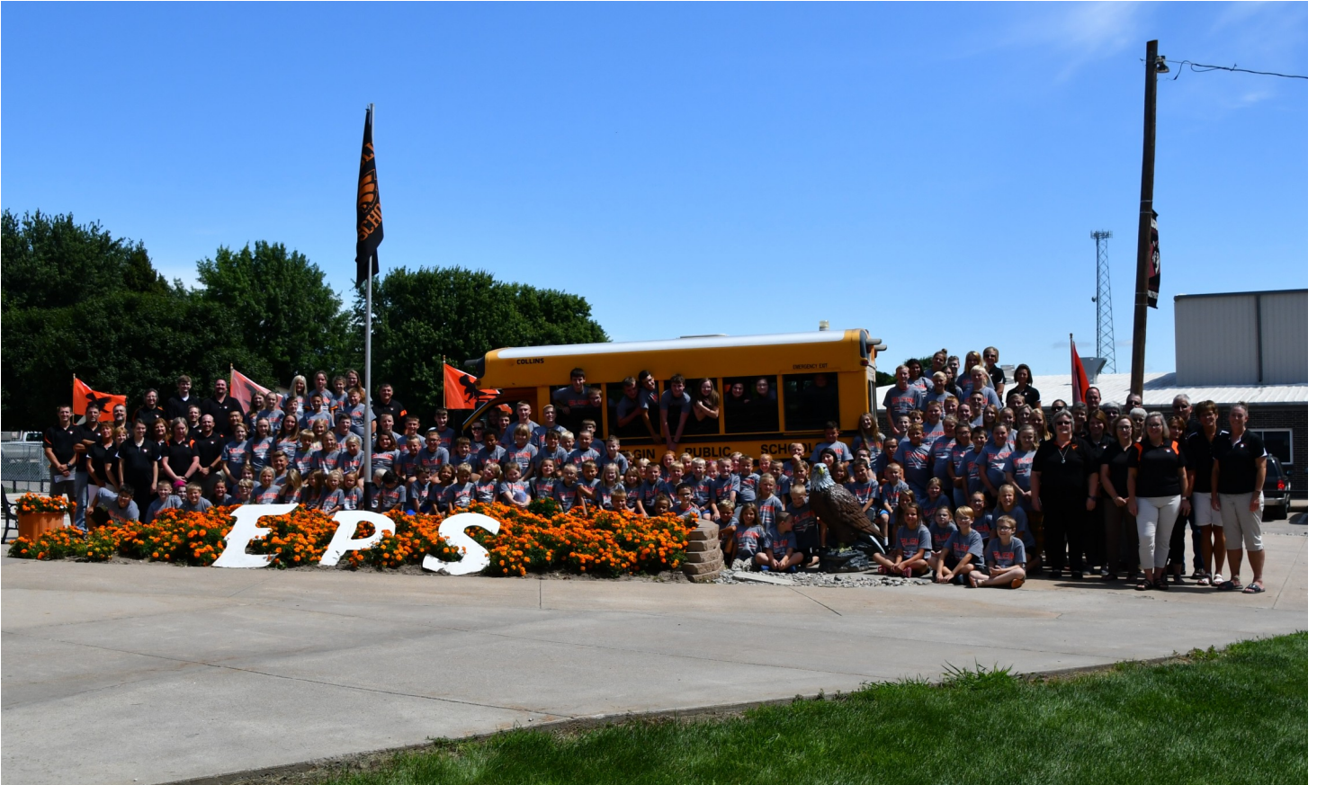
Elgin Public School students and staff are off to a terrific start! Students and staff were very patient to pose for this picture on the first day of school, August 14th. It took some work, but we managed to get some great smiles!