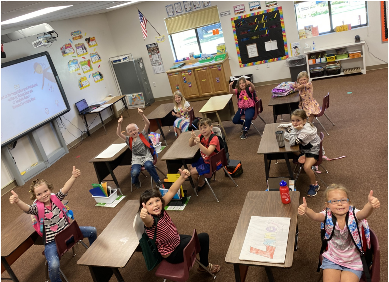
First grade is SO excited to be back in school!